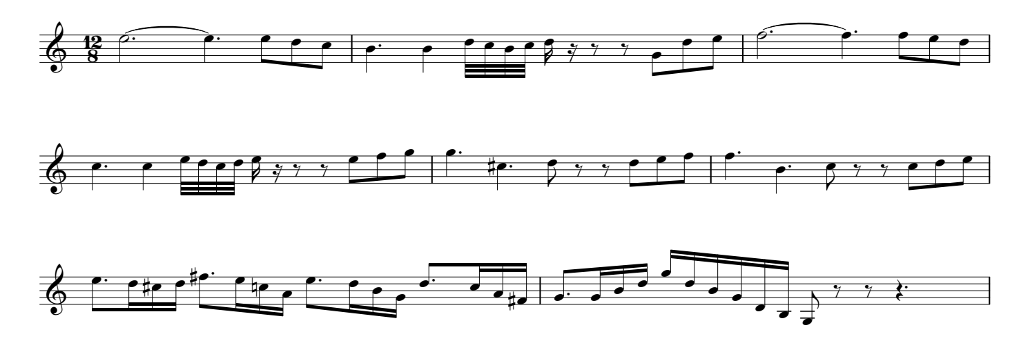
8. Compound Quadruple. Saint Seans: Le Cygne

4 7. Compound Quadruple. Paganini: Sonata III for Violin and Guitar